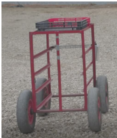
Figure 1: Obstacles example: static trolley